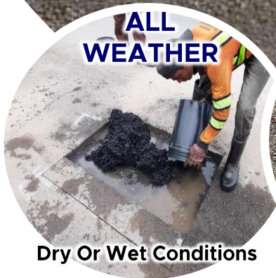
Dry Or Wet Conditions